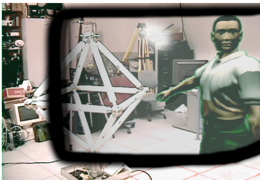
Figure 1: Our embodied agent Mirage is situated in the lab. Here we see how he appears to the user through the head-mounted glasses. (Image has been enhanced for clarity.)

Behind this work lies the conjecture that the mind can be modeled through the adequate combination of interacting, functional machines (modules). Of course, this is still debated in the research community and not all researchers are convinced of its merits. However, this claim is in its essence simply a combination of two less radical ones. First, that a divide-and-conquer methodology will be fruitful in studying the mind as a system. Since practically all scientific results since the Greek philosophers are based on this, it is hard to argue against it. In contrast to the search for unified theories in physics, we see the search for unified theories of cognition in the same way as articulated in Minsky's [1986] theory, that the mind is a multitude of interacting components, and his (perhaps whimsical but fundamental) claim that the brain is a hack. 3 In other words, we expect a working model of the mind to incorporate, and coherently address, what at first seems a tangle of control hierarchies and data paths. Which relates to another important theoretical stance: The need to model more than a single or a handful of the mind's mechanisms in isolation in order to understand the working mind. In a system of many modules with rich interaction, only a model incorporating a rich spectrum of (animal or human) mental functioning will give us a correct picture of the broad principles underlying intelligence.